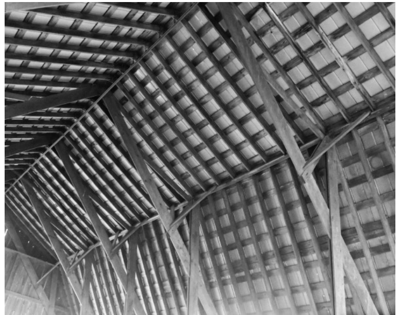
4. Barn on Randall Road

The three images on this page Russ King. His commentary is on the previous page