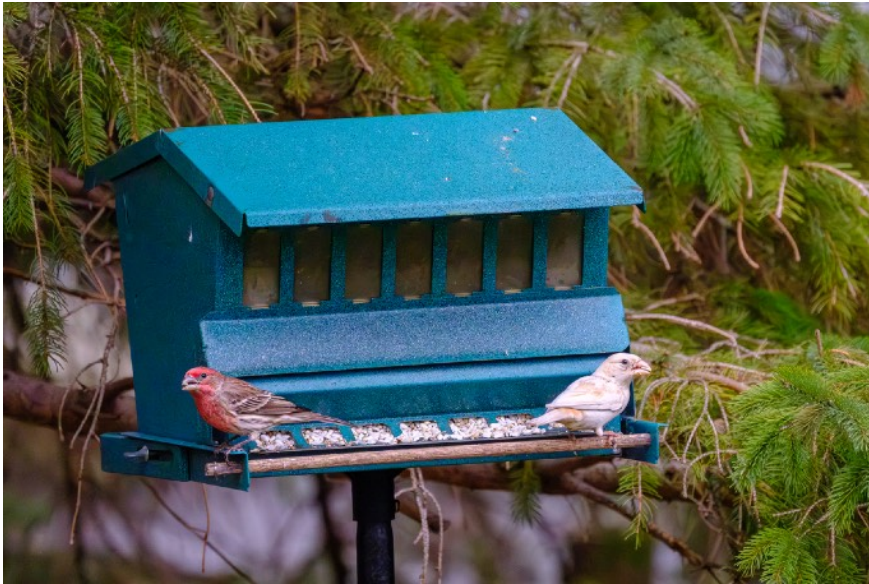
Normal Color and White House Finches

Doug said - The white bird is an leucistic house finch (not albino). In the second photo is the normal color house finch with the leucistic finch. Birds with abnormal plumages are very rare, and both leucism and albinism are easily recognized and more commonly reported than other abnormal plumages. According to survey data, leucism and albinism occur at a rough estimate of 1 in 30,000 birds.