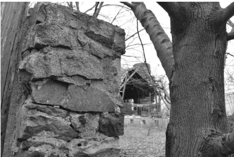
5. Stone Foundation at the Barn on Randall Road