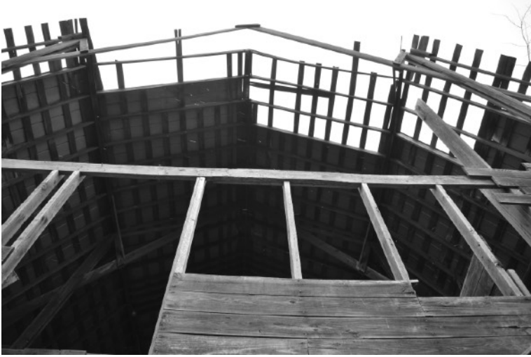
3. Barn on Randall Road