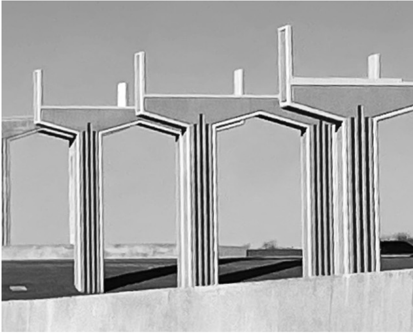
1. A Group of Piers Waiting for Their Beams