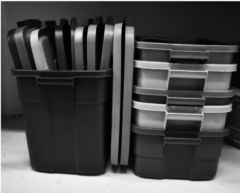
2. Storage Boxes

5. The remaining stone wall of the house overlooking the abandoned barn.