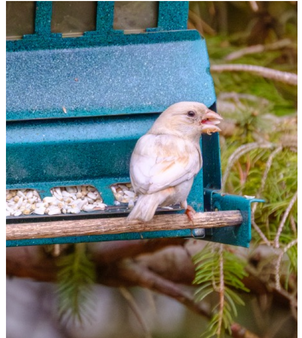
White House Finch