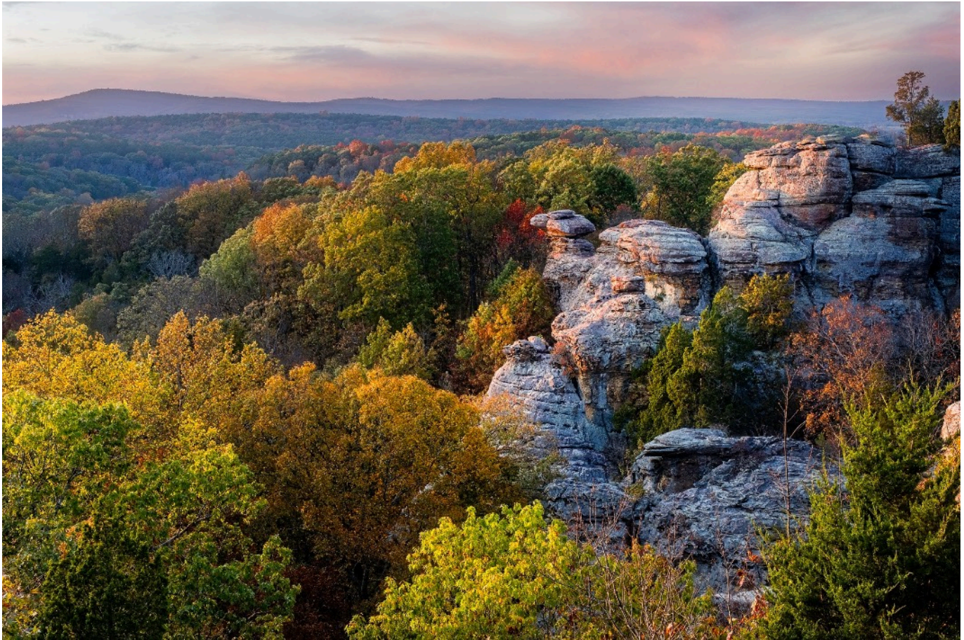
Garden Of The Gods, Shawnee National Forest