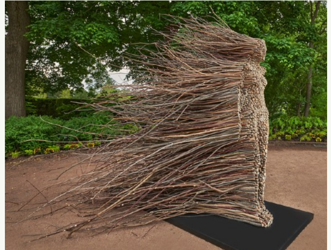
Stillness in Motion (2023) by Olga Ziemka Locally reclaimed branches, wire, metal armature Morton Arboretum

The artist's work will be created from reclaimed tree branches and other natural materials gathered from various locations throughout the Arboretum's 1,700 acres. "I am giving reclaimed natural materials a new life and transforming them from nature into new forms," Ziemka said.