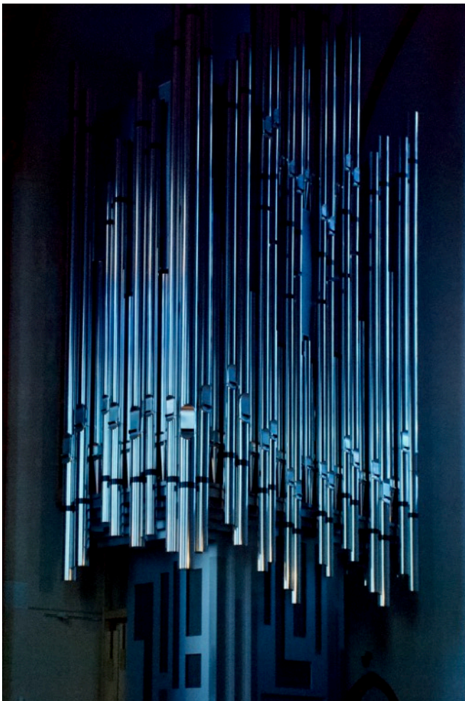
Strasbourg Cathedral Organ