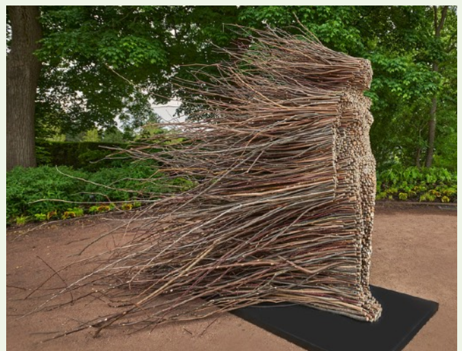
Stillness in Motion (2023) by Olga Ziemka Locally reclaimed branches, wire, metal armature Morton Arboretum

The artist's work will be created from reclaimed tree branches and other natural materials gathered from various locations throughout the Arboretum's 1,700 acres. "I am giving reclaimed natural materials a new life and transforming them from nature into new forms," Ziemka said.