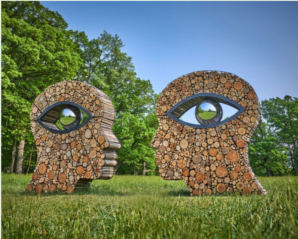
Mind Eye (2023) by Olga Ziemka Locally reclaimed wood logs, metal armature Morton Arboretum