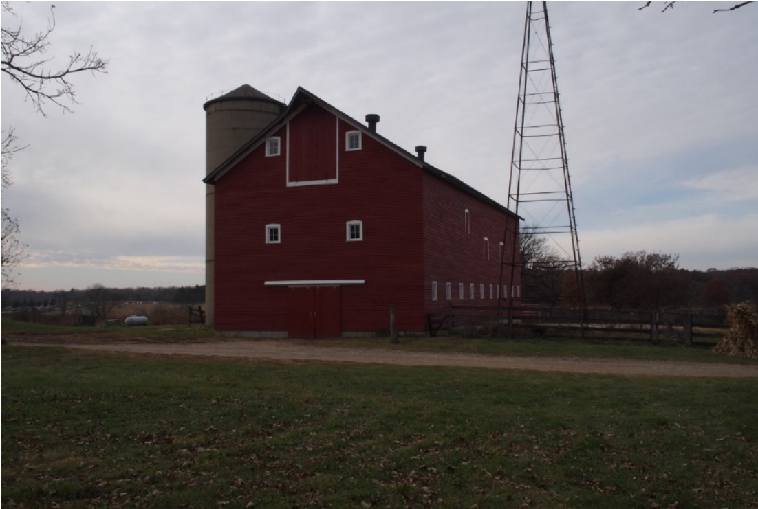
Red Barn (Before)