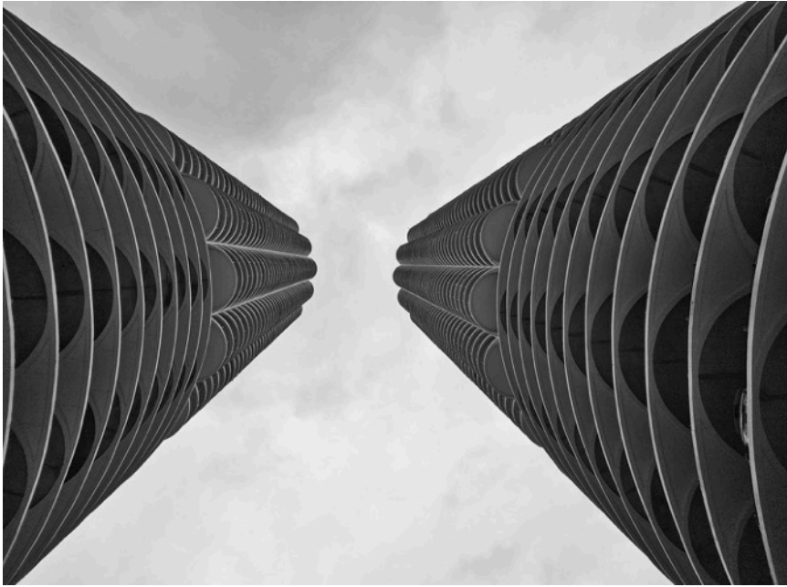
Slightly Asymmetrical Monochrome by Peter Pelke

A different take on Marina Towers in downtown Chicago