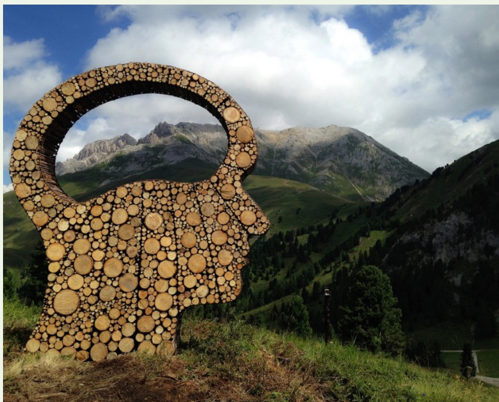
Mind Eye (2015) by Olga Ziemska Locally reclaimed wood logs, metal armature Permanent Outdoor Sculpture RespirArt Sculpture Park, Dolomite Mountains, Italy