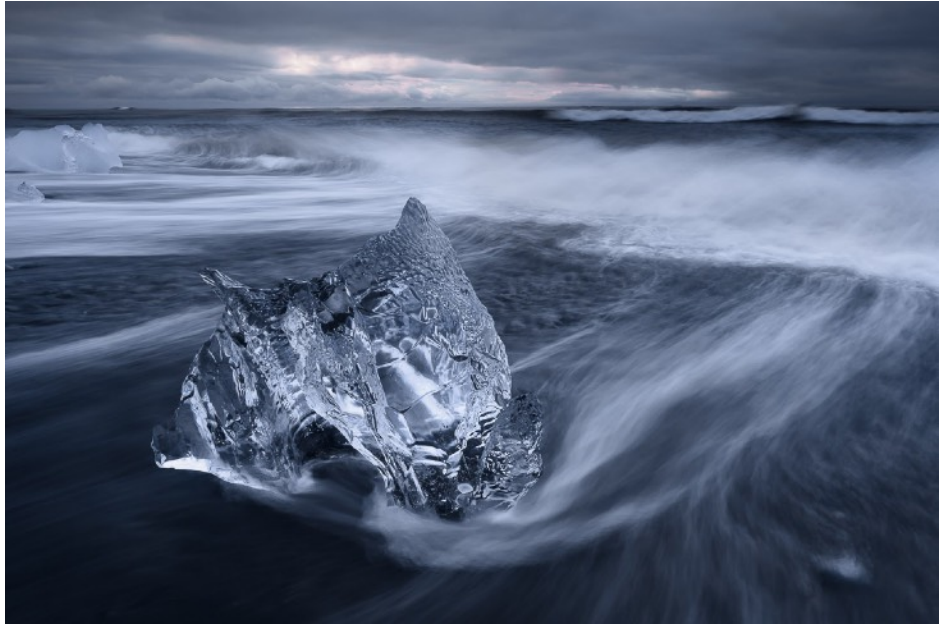
NIKON D800E + 24mm f/1.4 @ 24mm, ISO 100, 6/10, f/16.0

If your camera is mirrorless and has a histogram or zebras, enable them. These tools allow you to check your exposure and more easily get a properly-exposed photograph.