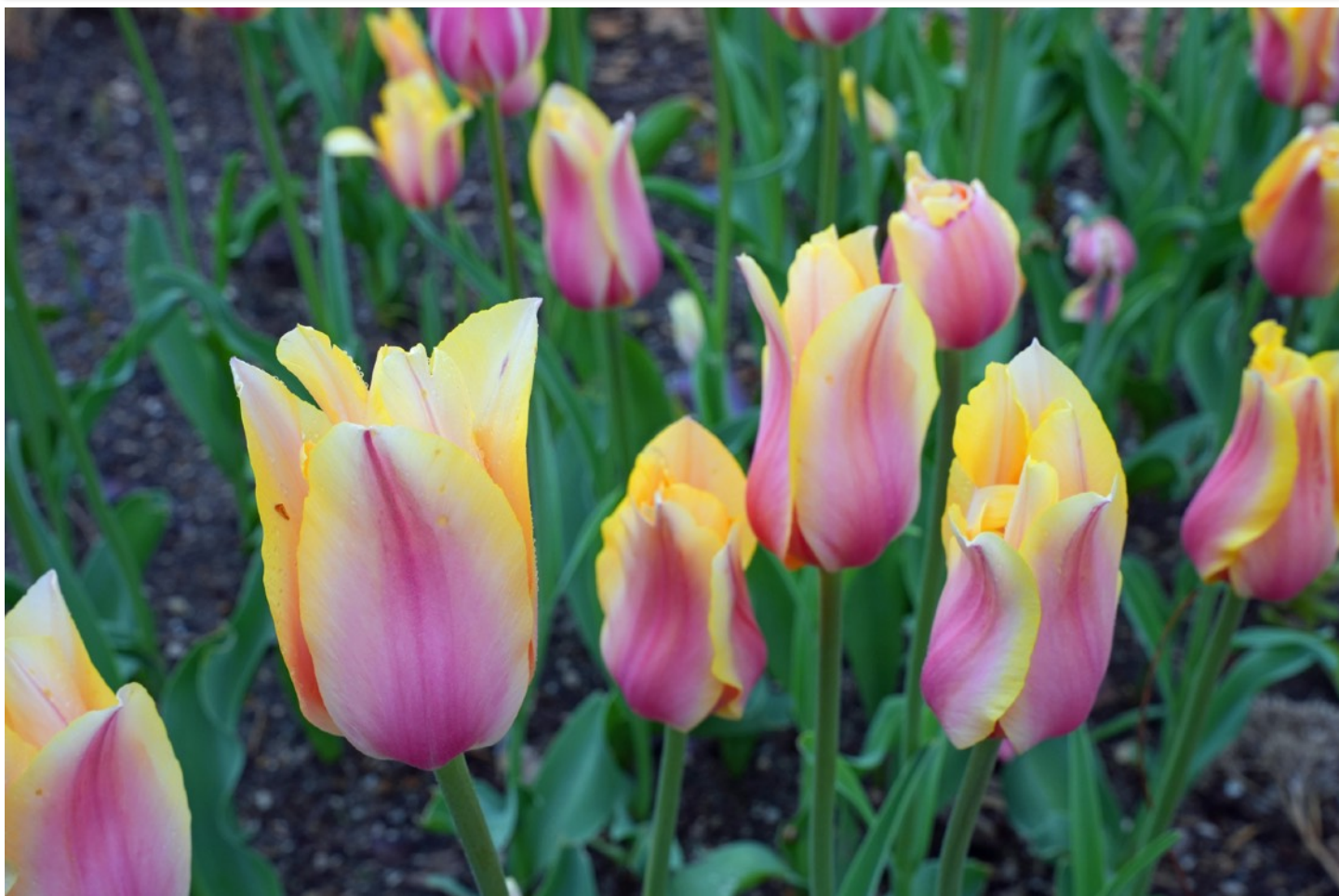
Tulip Festival, Holland, MI

Serving Crystal Lake, IL and Surrounding Communities Since 1980 crystallakecameraclub.com