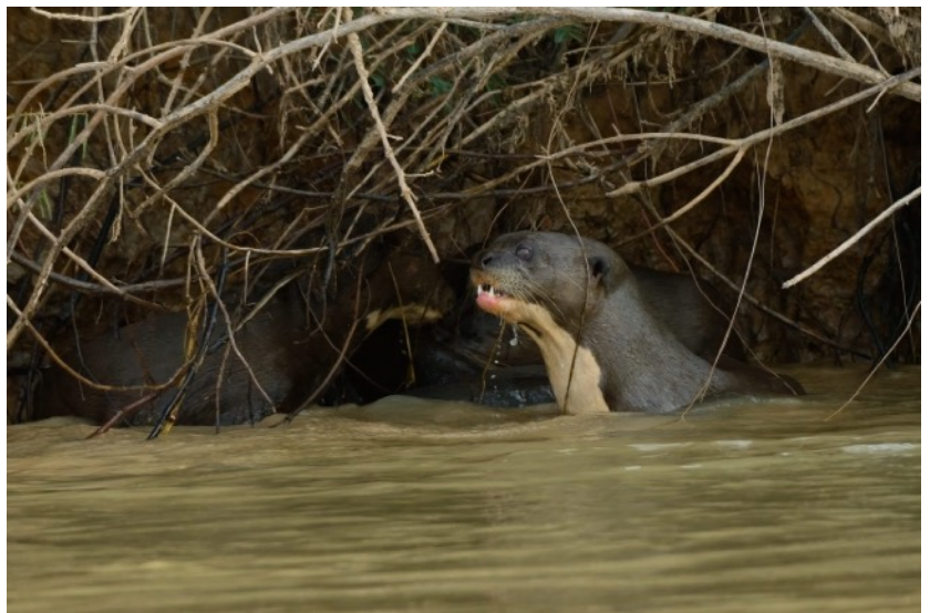
Crowded Den (Otters) DPI Color