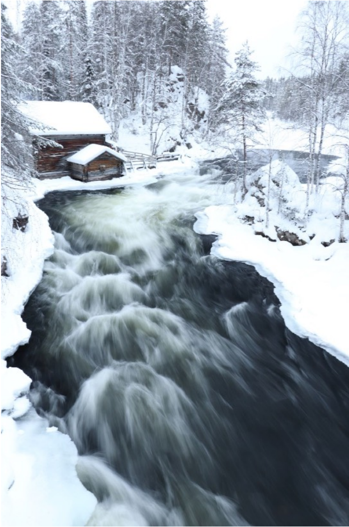
Lapland River and Mill