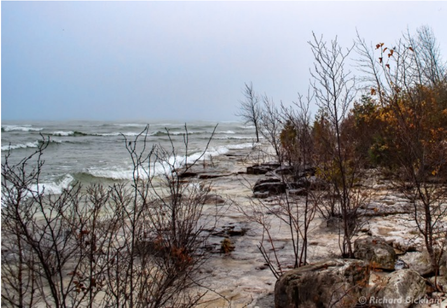
Cana Island Breaking Waves