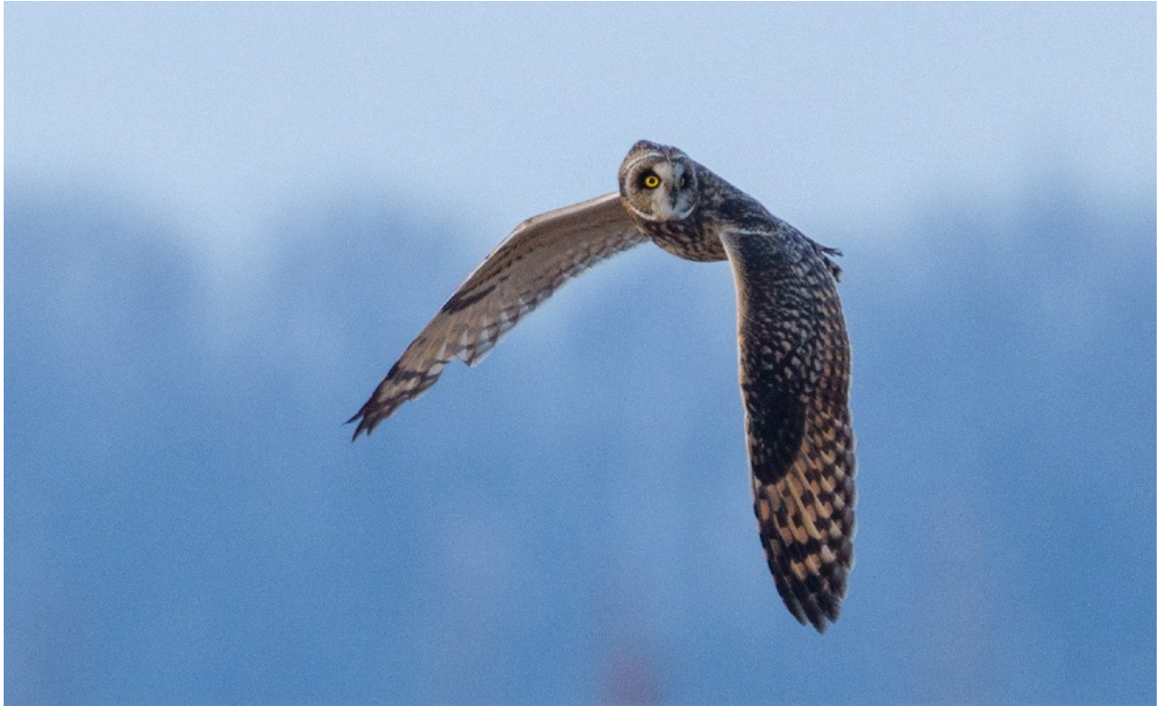
Short-Eared Owl DPI Color by Ken Farver