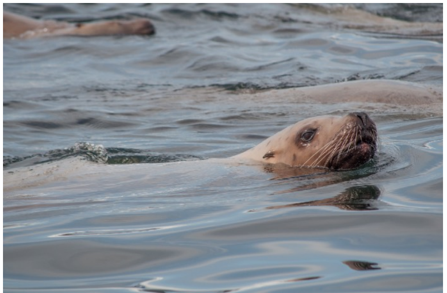
Juneau Whale Watching Scene (Sea Lion)