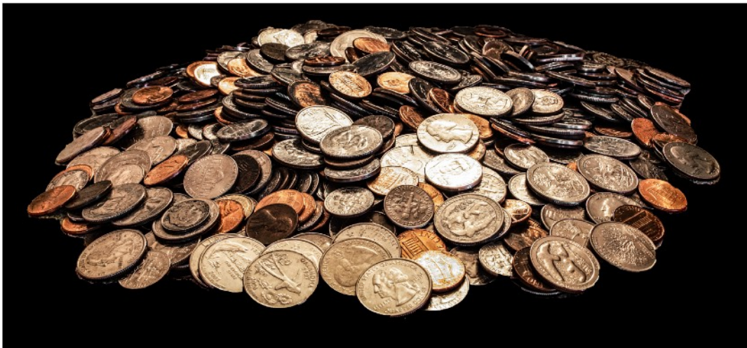
Spare Change , DPI Color by Rich Bickham