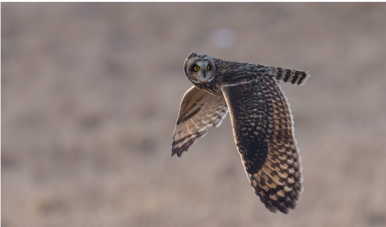
Short-Eared Owl DPI Color by Ken Farver