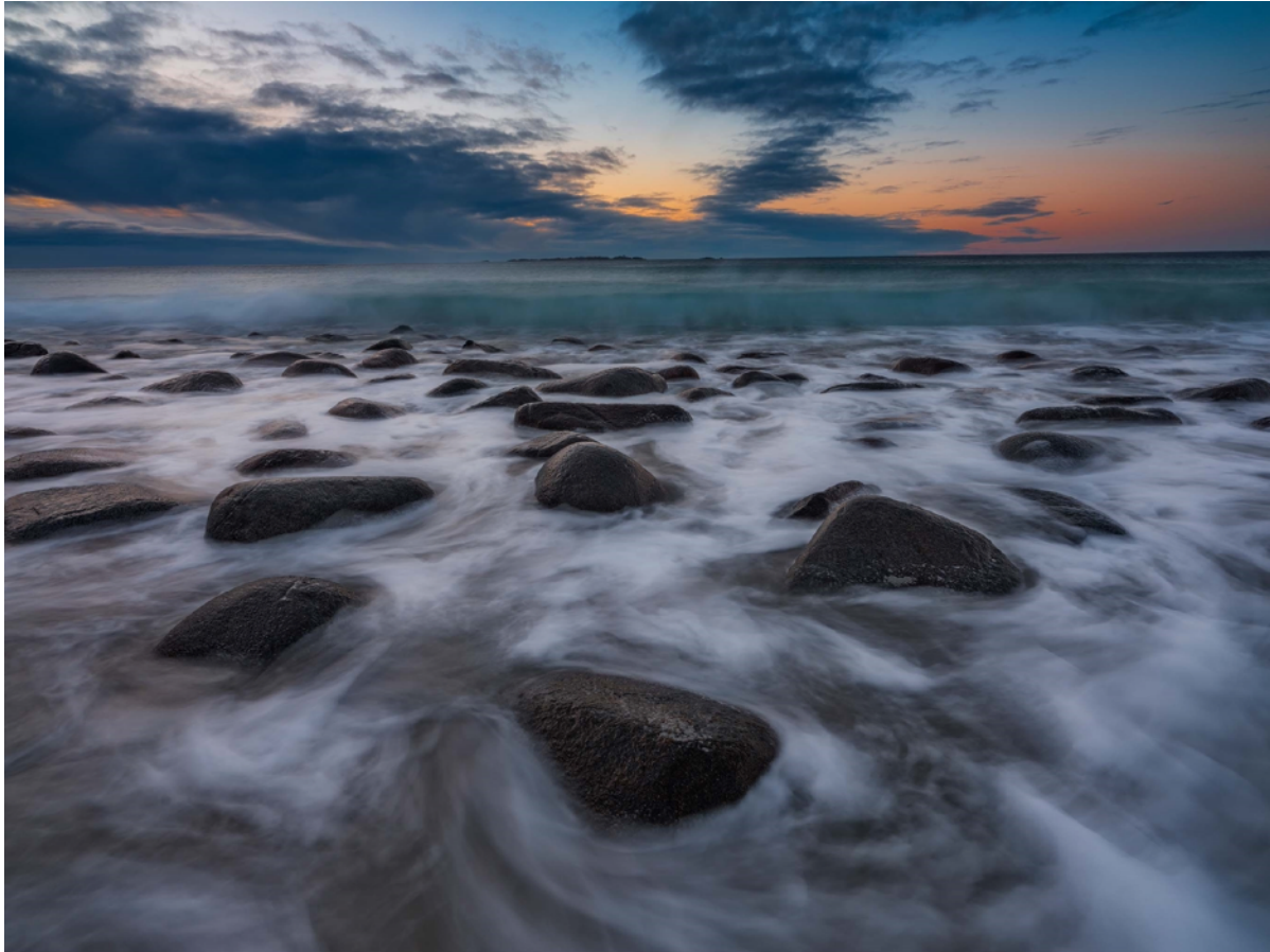
Unstad Beach – Vestvågøy, Norway