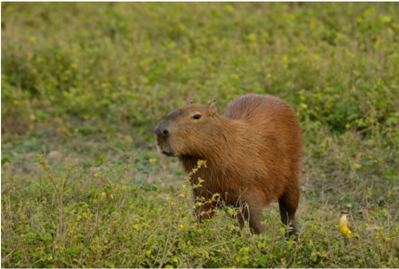
Lone Capybara DPI Color