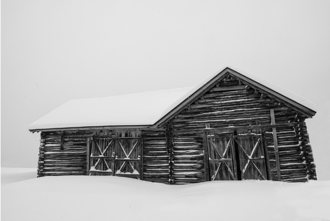
Isolated Barn Monochrome by Jeff Chemelewski Award

Editor's Note: The Award images from the April competition are shown here and the cover page. All four were included in the voting for the 2023 Image of the Year.