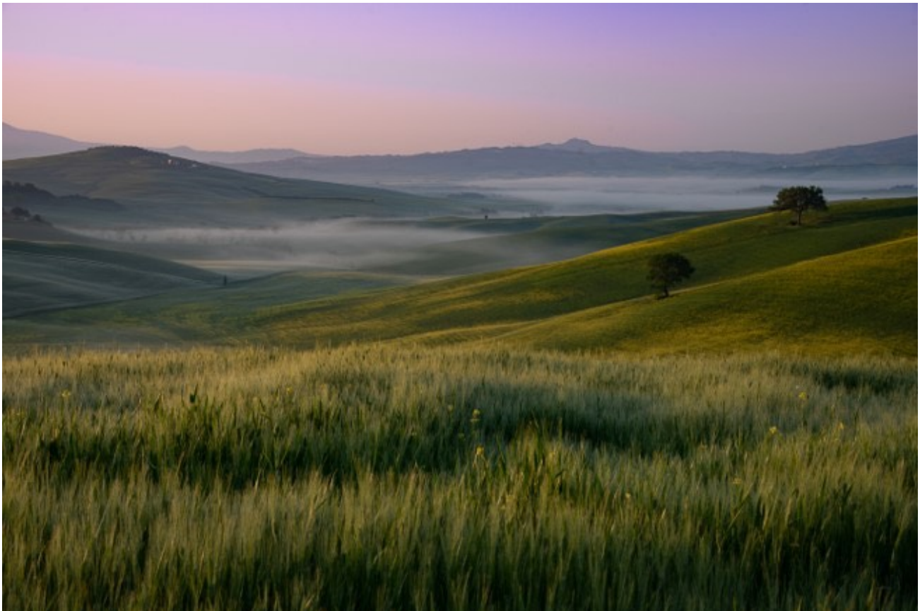
Tuscany Color by Gail Schulz