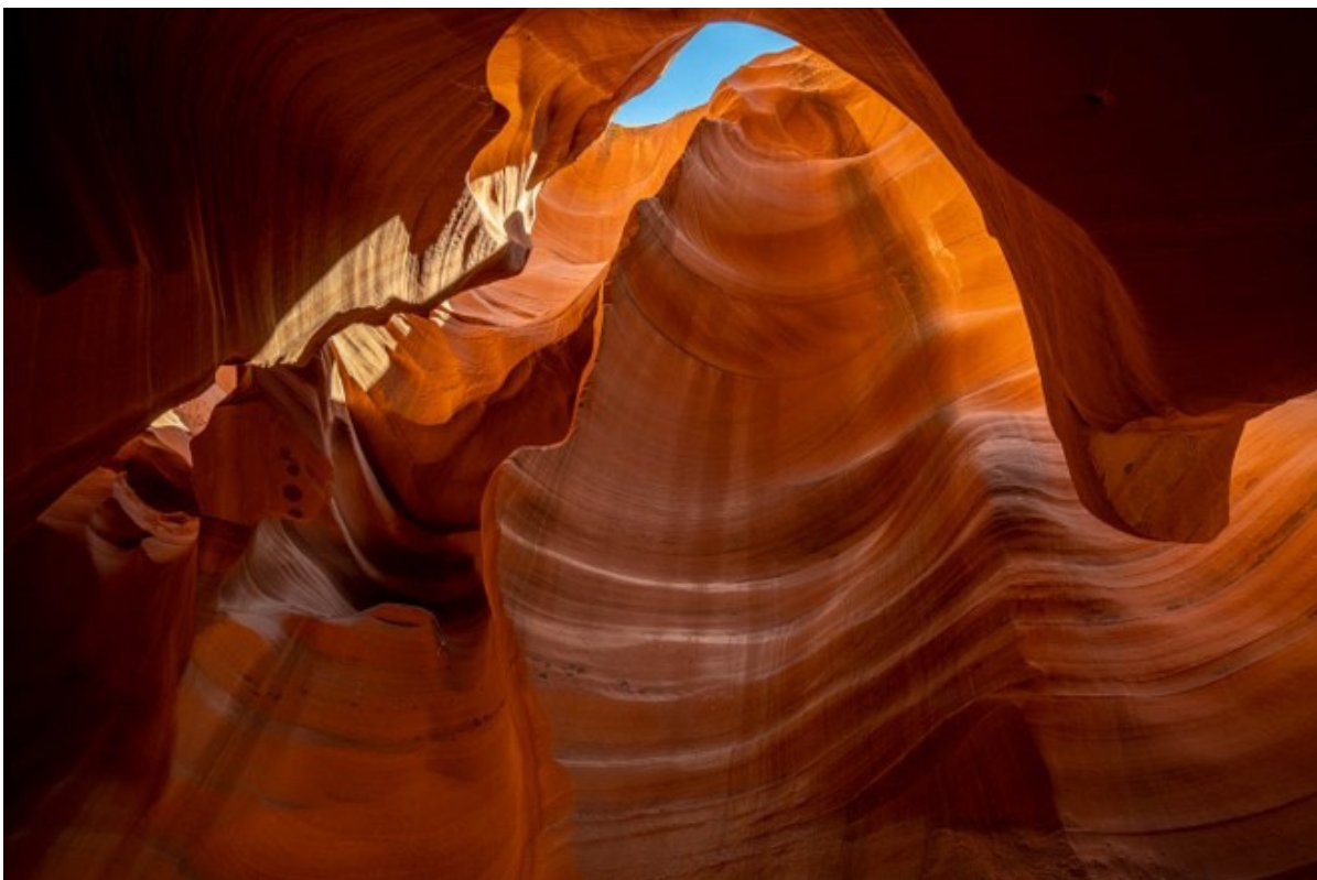
After the Water is Gone