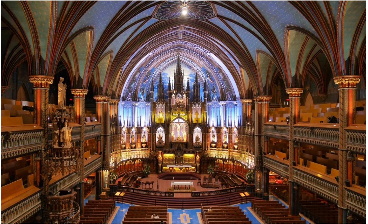
Notre Dame Basilica Color by Royal Pitchford