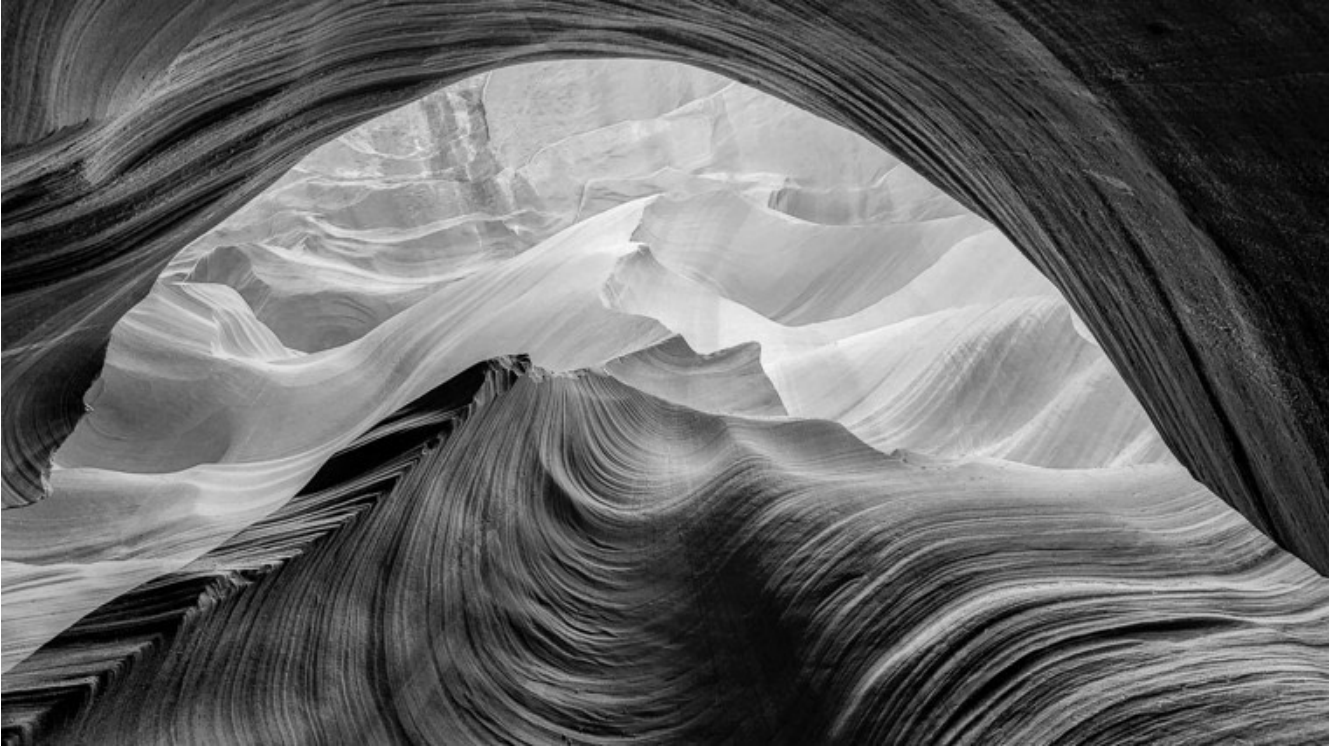
Antelope Canyon Wave Cave Monochrome