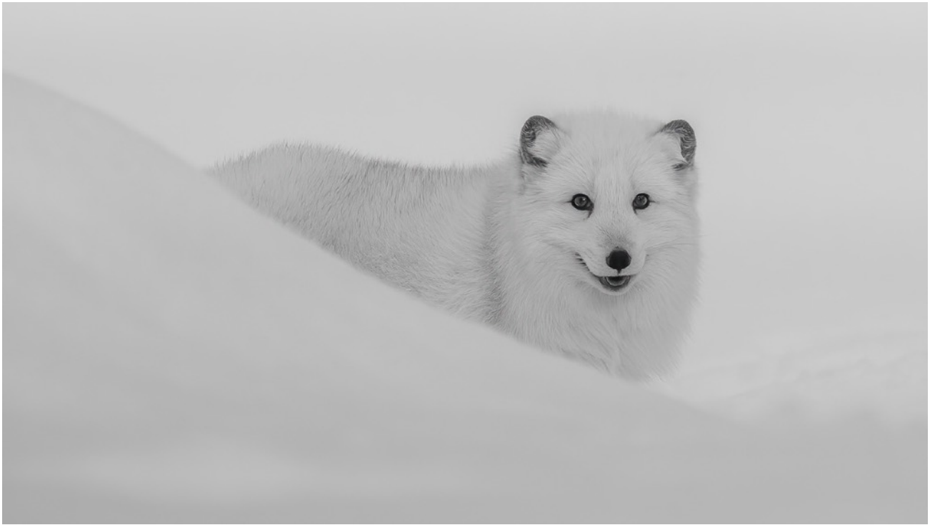
Arctic Fox Monochrome by Joe Norton