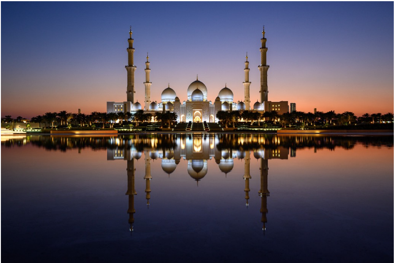
Taken with the Nikon Z50, an entry-level mirrorless camera

Camera gear is not all that important, as a general rule, as most of it these days is excellent. Granted, some gear is better suited for specific projects, but much more important are your creative skills and your knowledge of camera settings. Focus your effort on those, not on collecting camera equipment.