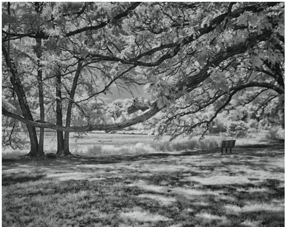
The Park Bench by Peter Pelke

Infrared image processed in NIK in Silver EFX Pro plugin for Photoshop Elements