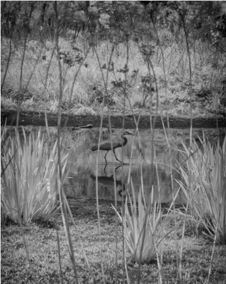
Great Blue Heron by Peter Pelke

Infrared image processed in NIK in Silver EFX Pro plugin for Photoshop Elements