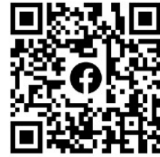
The Star Of The Show by Gail Schulz

Editor's Note: CLCC has a group chat page on FaceBook where you can freely post images that you'd like to share. Only page members can see who's in the group and what is posted. Here's the direct link to the page and a QR Code to scan. CLCC Group Chat FB Page