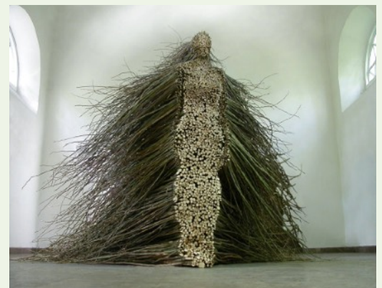
Stillness in Motion (2002) by Olga Ziemska Locally reclaimed willow branches, wire, metal armature Centre of Polish Sculpture, Chapel Gallery, Oronsko, Poland

The artist's work will be created from reclaimed tree branches and other natural materials gathered from various locations throughout the Arboretum's 1,700 acres. "I am giving reclaimed natural materials a new life and transforming them from nature into new forms," Ziemska said.