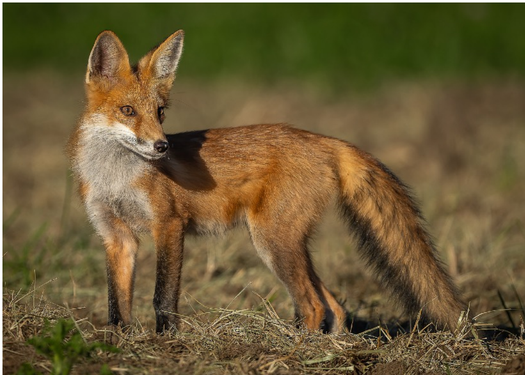
Red Fox 7 – Lake Decatur DPI Color Honorable Mention and November CACCA Award