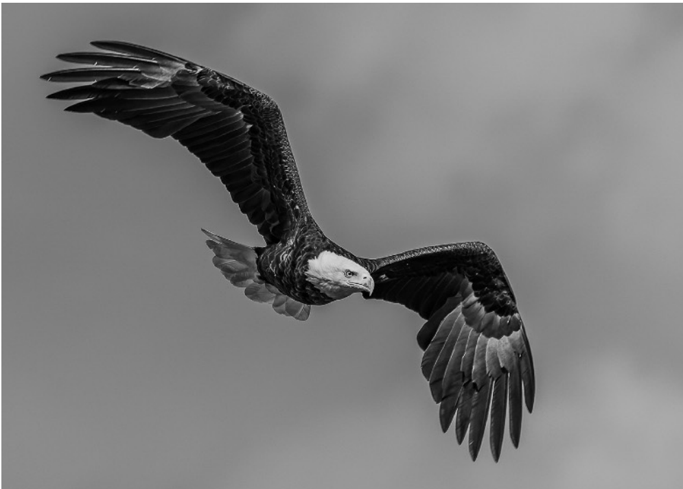
Bald Eagle 3 - Lake Decatur

DPI Monochrome by Joe Norton Honorable Mention