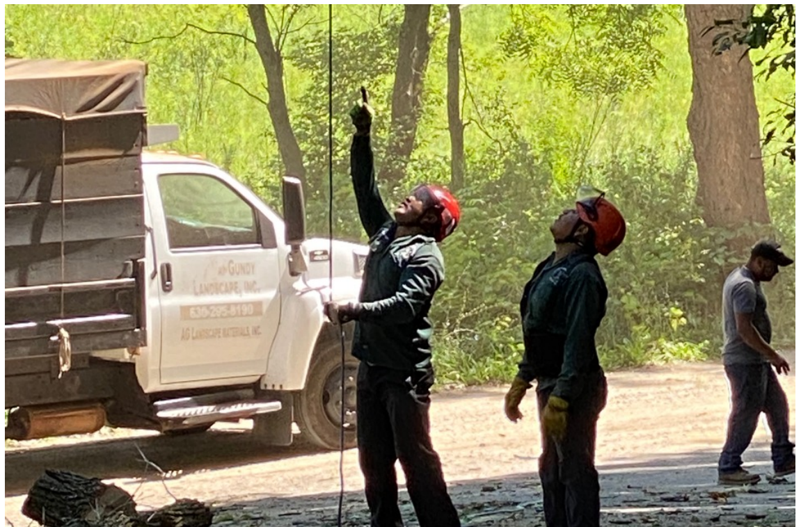
Taking Down the Old Old Oak