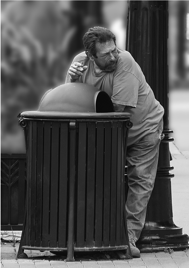
Nowhere To Go