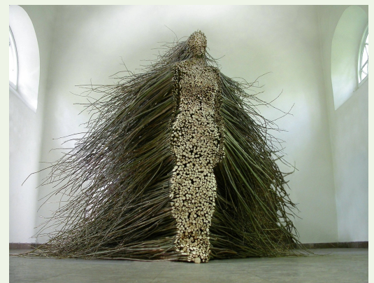
Stillness in Motion (2002) by Olga Ziemska Locally reclaimed willow branches, wire, metal armature Centre of Polish Sculpture, Chapel Gallery, Oronsko, Poland

The artist's work will be created from reclaimed tree branches and other natural materials gathered from various locations throughout the Arboretum's 1,700 acres. "I am giving reclaimed natural materials a new life and transforming them from nature into new forms," Ziemska said.