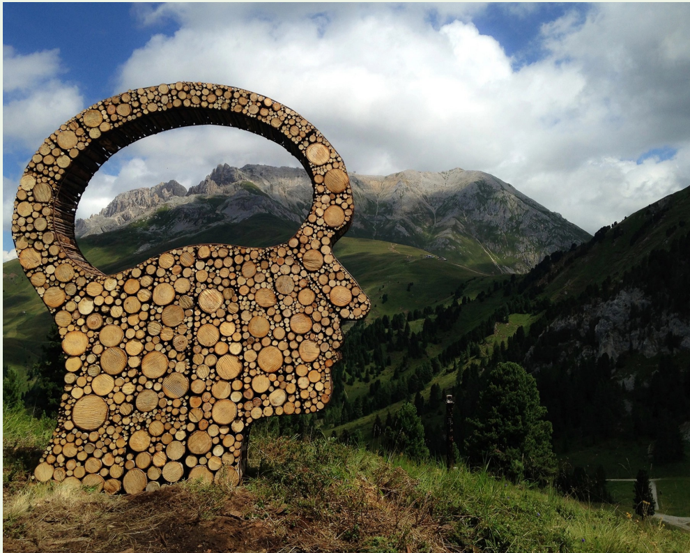
Mind Eye (2015) by Olga Ziemska Locally reclaimed wood logs, metal armature Permanent Outdoor Sculpture RespirArt Sculpture Park, Dolomite Mountains, Italy