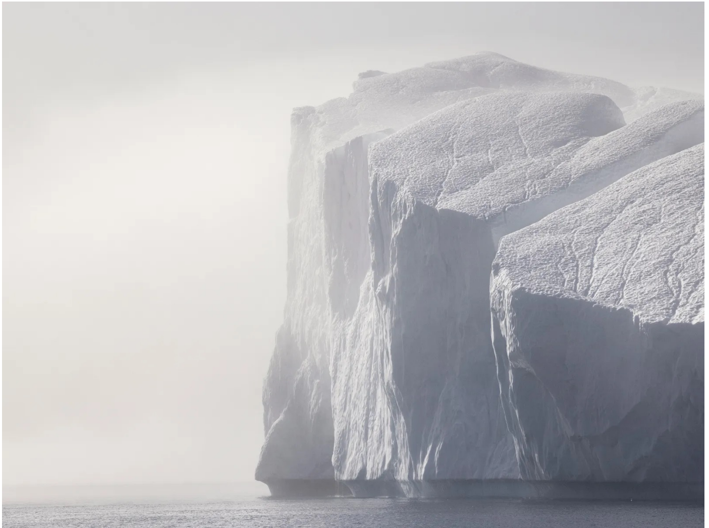
Disko Bay, in Greenland, in 2021.

visual effect was mild, at first, the psychological effect less so. Glaucoma filled him with ‘a rage to see,’ as he put it. “To see more, to see beyond—to see at the maximum.”