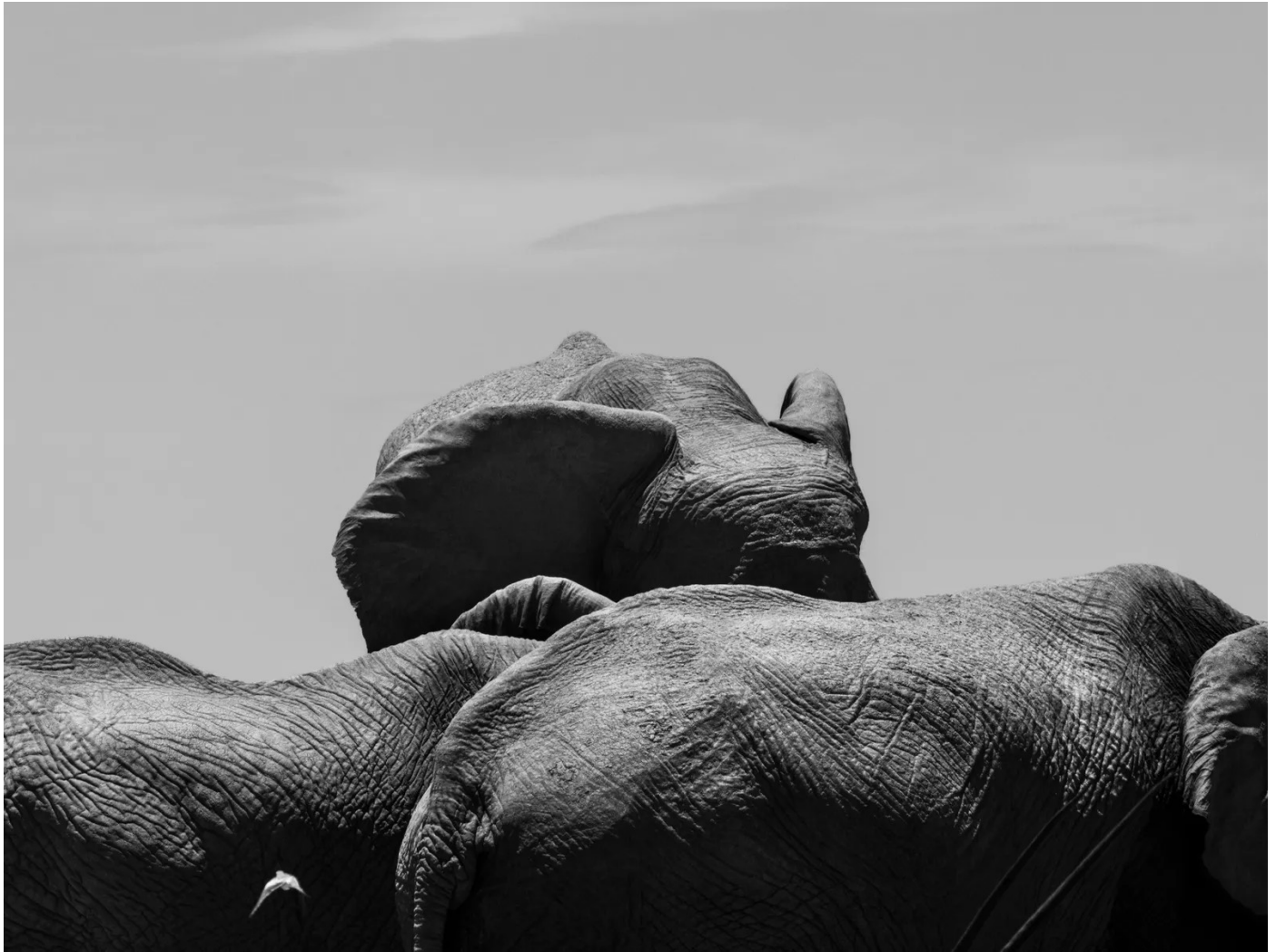
Elephants, in Etosha National Park, Namibia, in early 2022.

is ill-equipped to represent this,' he told me. So he decided to exclude from his frames the viewer's only anchor: the horizon. 'How do you render an experience of the sublime? You address the idea of infinity,' he said. "Now the macro can become the micro, and vice versa. Space becomes a mental state."