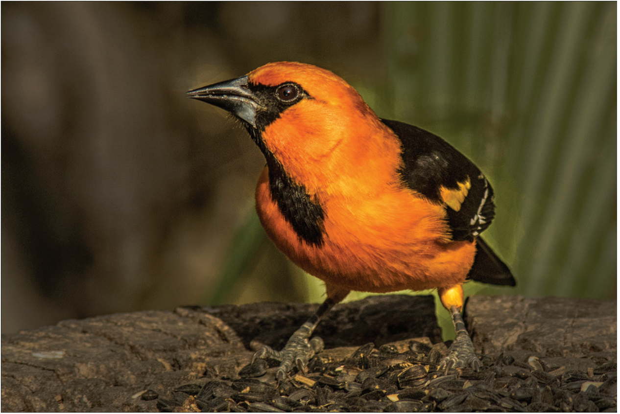
Norm Kopp Altamira Oriole