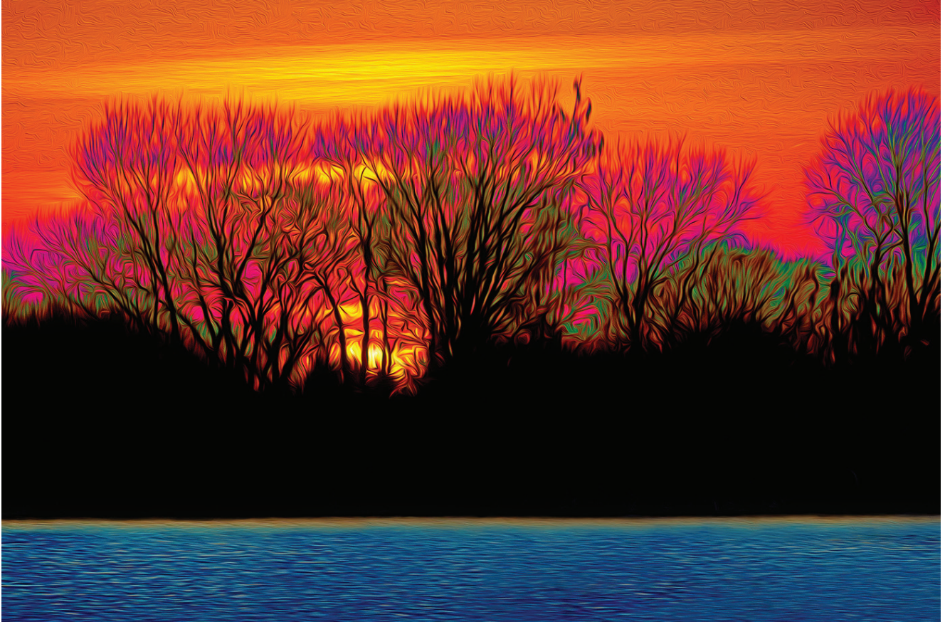
Connie Sonnenberg Woodcreek Park at Sunset