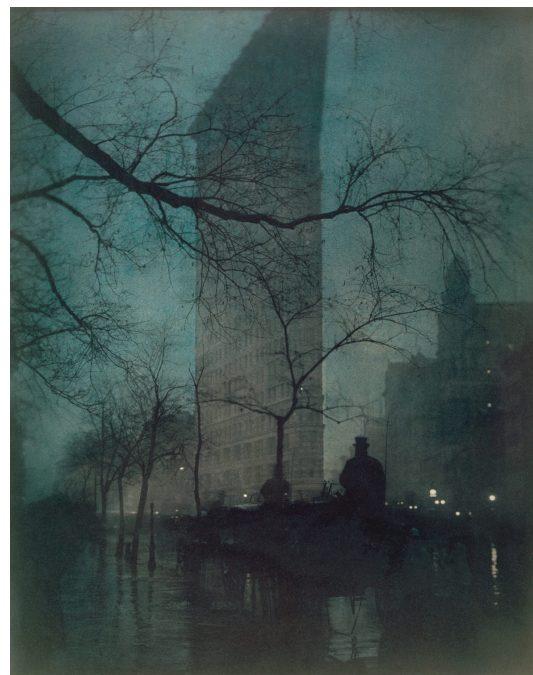
Title: Flatiron © by Edward J. Steichen c.1904, printed 1909, Medium: Gum bichromate over platinum print

In 1900, Steichen became the United States naturalized citizen. Soon after he left Wisconsin and was heading to Paris to study painting, but first, he stopped in New York to go to Camera Club of New York to show his work to Alfred Stieglitz. Stieglitz is an American photographer and Vice President of the club and editor of its journal Camera Notes. He was impressed by the young Milwaukee