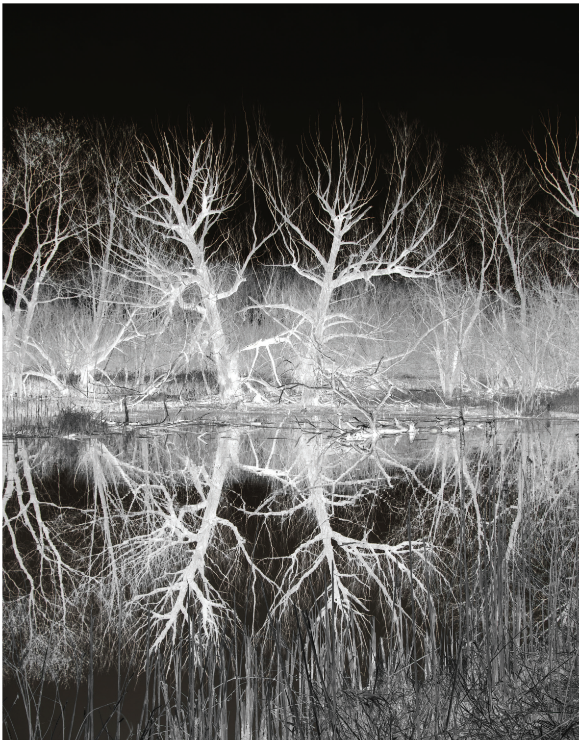
Rich Bickham The Twins