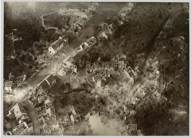
Title: Vaux #2, After Attack © by Edward J. Steichen c. 1918 Medium: Gelatin silver print

During the two World Wars, he served as a military photographer and propagandist who organized highly innovative exhibitions in support of the war effort. "Commissioned a lieutenant commander in 1942, Steichen became director of the U.S. Naval Photographic Institute in 1945; there he oversaw combat photography and organized