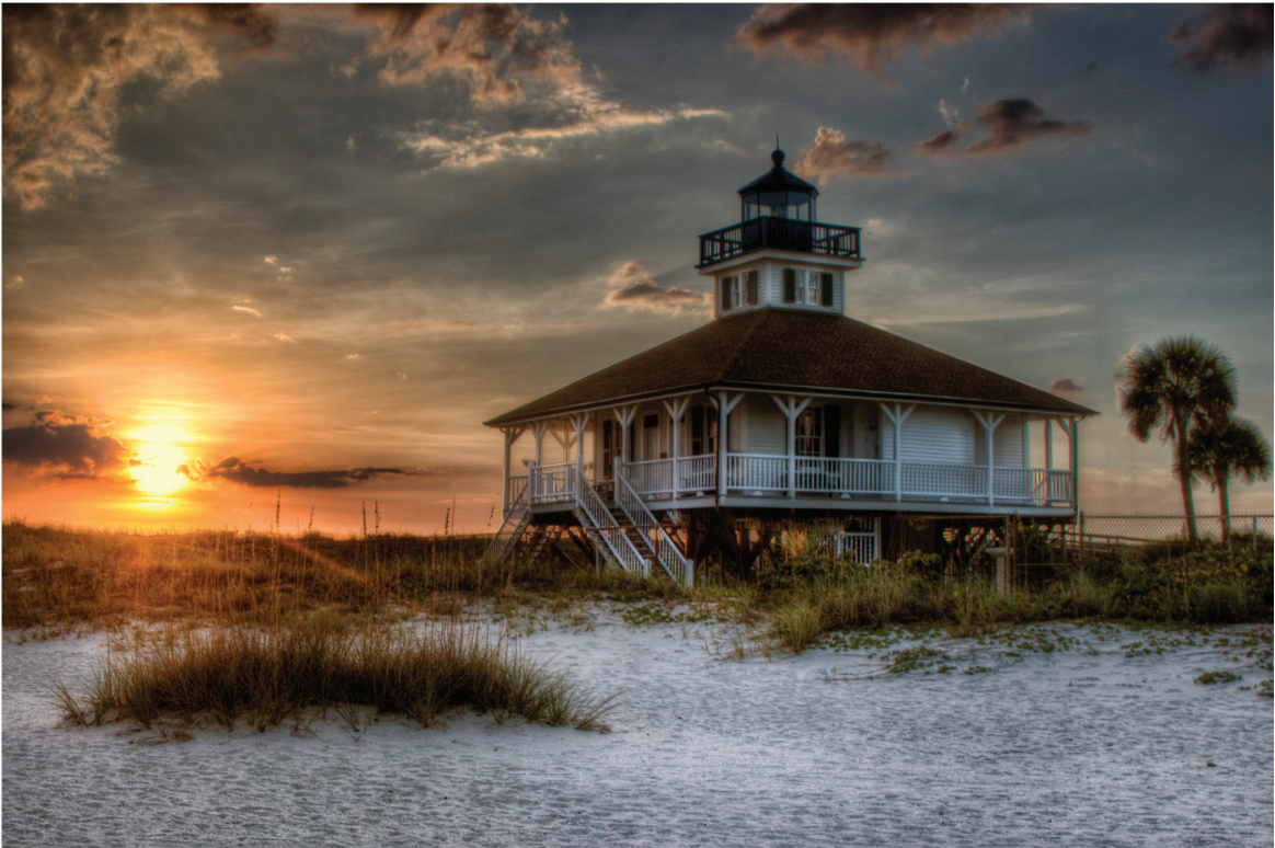
Sanda Wittman Lighthouse Sunset